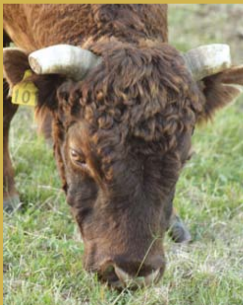
1st: Riverlea Ducati.