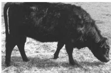
Bellebrae Genesis Yearling Heifer in calf to Charming Cherokee

Breeding for conformation, temperament, milk and beef through quality purebred and grade females and selected sires.