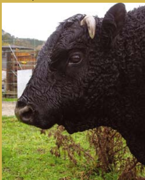
2nd: Gulliver.