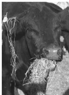
Pohutukawa Daisy Bell