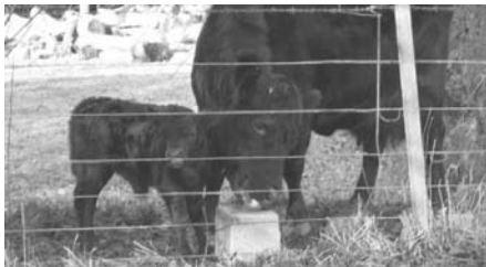
Abbey Road Miss Molly aged 1 week, July 2007