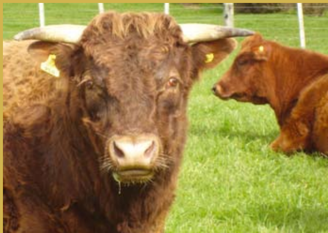
3rd: Summer Wine Thady.

Photo Gallery Sponsored By PEEL VIEW DEXTER STUD Kath and Josie Aker, 115 Main North Rd, Geraldine. Ph: 03 693 9380 Email: peelviewdexter@xtra.co.nz